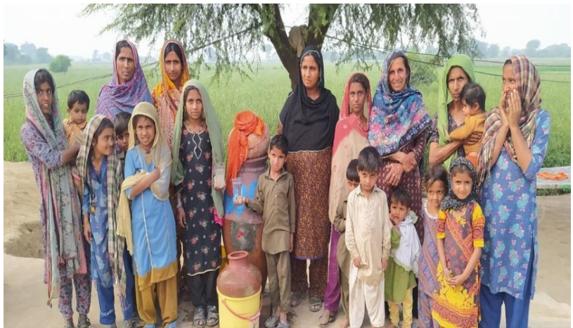
Women from Mahur Mallah village showing Nadi Filter

some 20 members from Allah Bux village and provided them Nadi filter training of trainers (ToT) training. The training was rolled out further by the trainees. Within days, all 56 families of village Mahur Mallah installed Nadi Filters in their houses and started drinking safe and clean water at their village level.